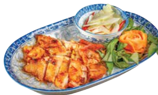
Roasted duck with herbs