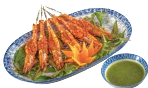
Grilled prawns with salt and chilli